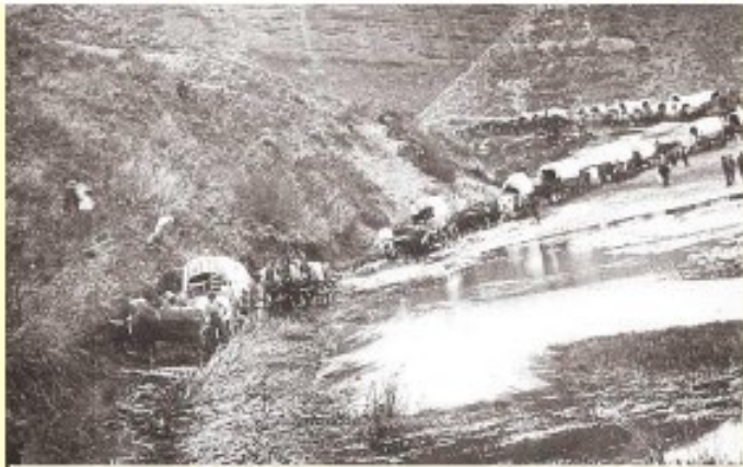
A Mormon wagon train in Echo Canyon, Utah

Controversy raged in the 1840s and 50s concerning the “Mormon Question”, primarily about polygamy. In 1857, the Federal government appointed Alfred Cumming to replace Brigham Young as the Utah territory governor. The U.S. Army was to escort him to Utah. In response, the Mormon’s raised a militia to oppose