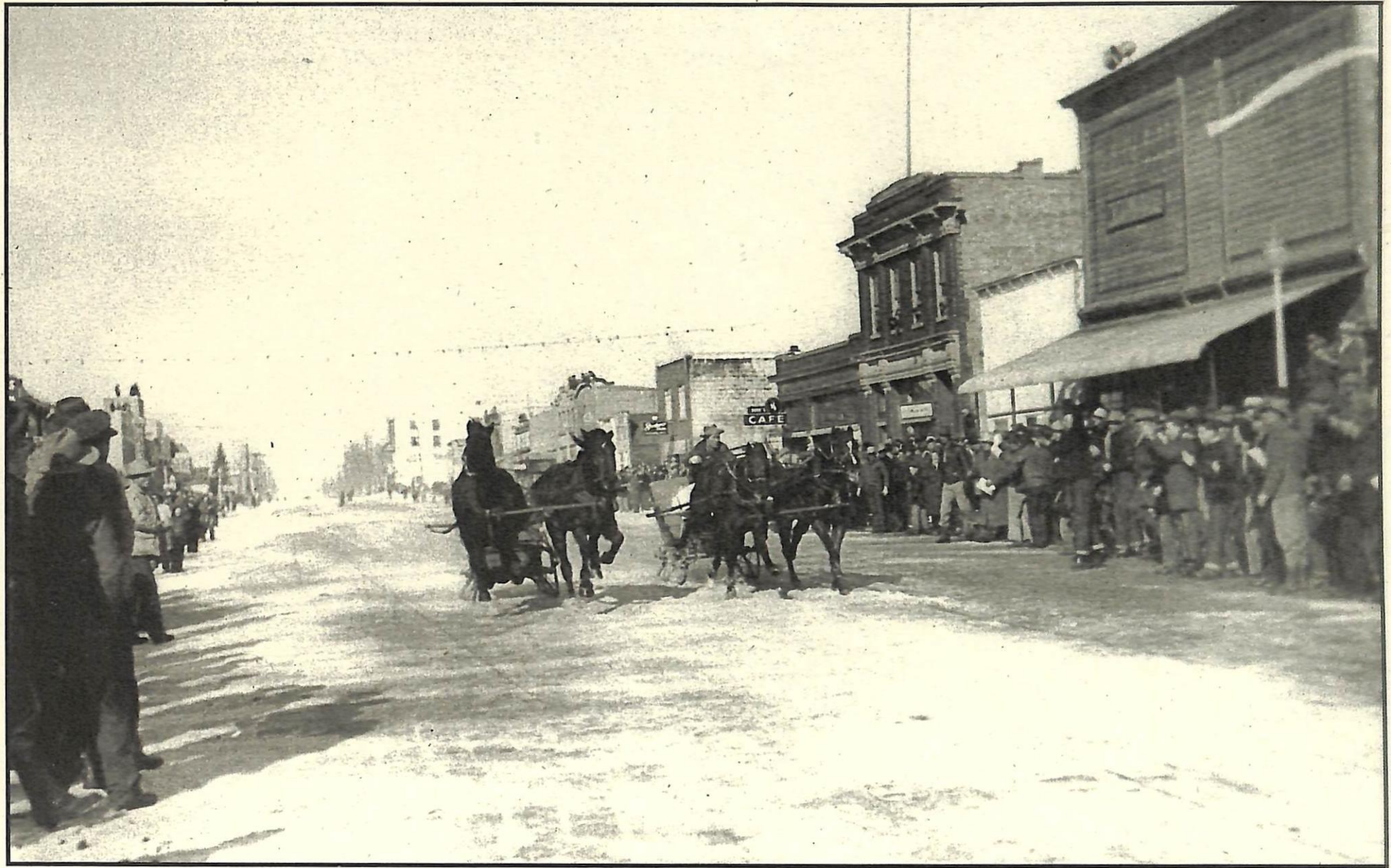
Cutter Racing down Main Street in Afton - 1948 Bill Stoker, Devon VaNoy