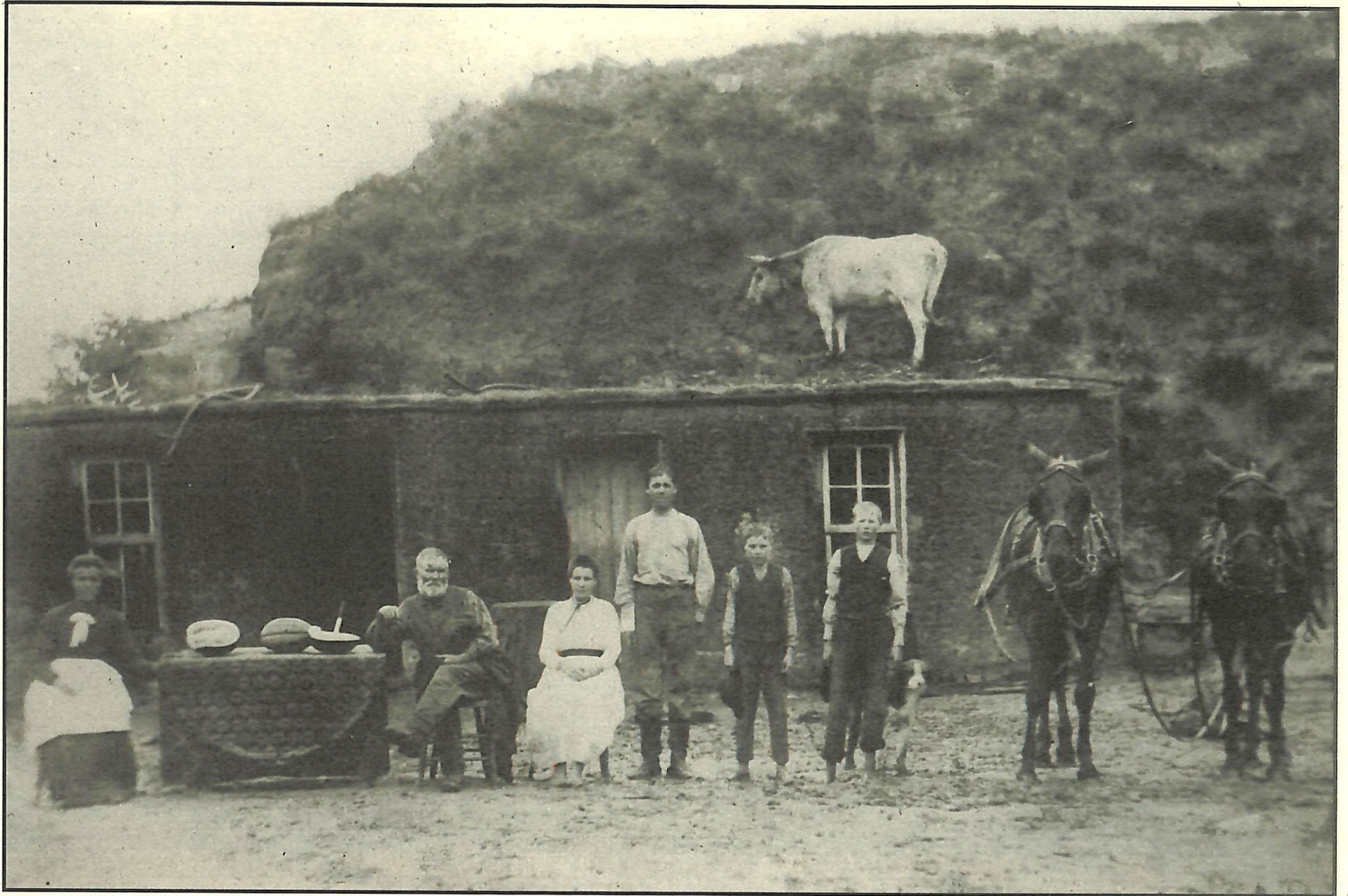
Dugout with unidentified family (all lined up for a photo!)