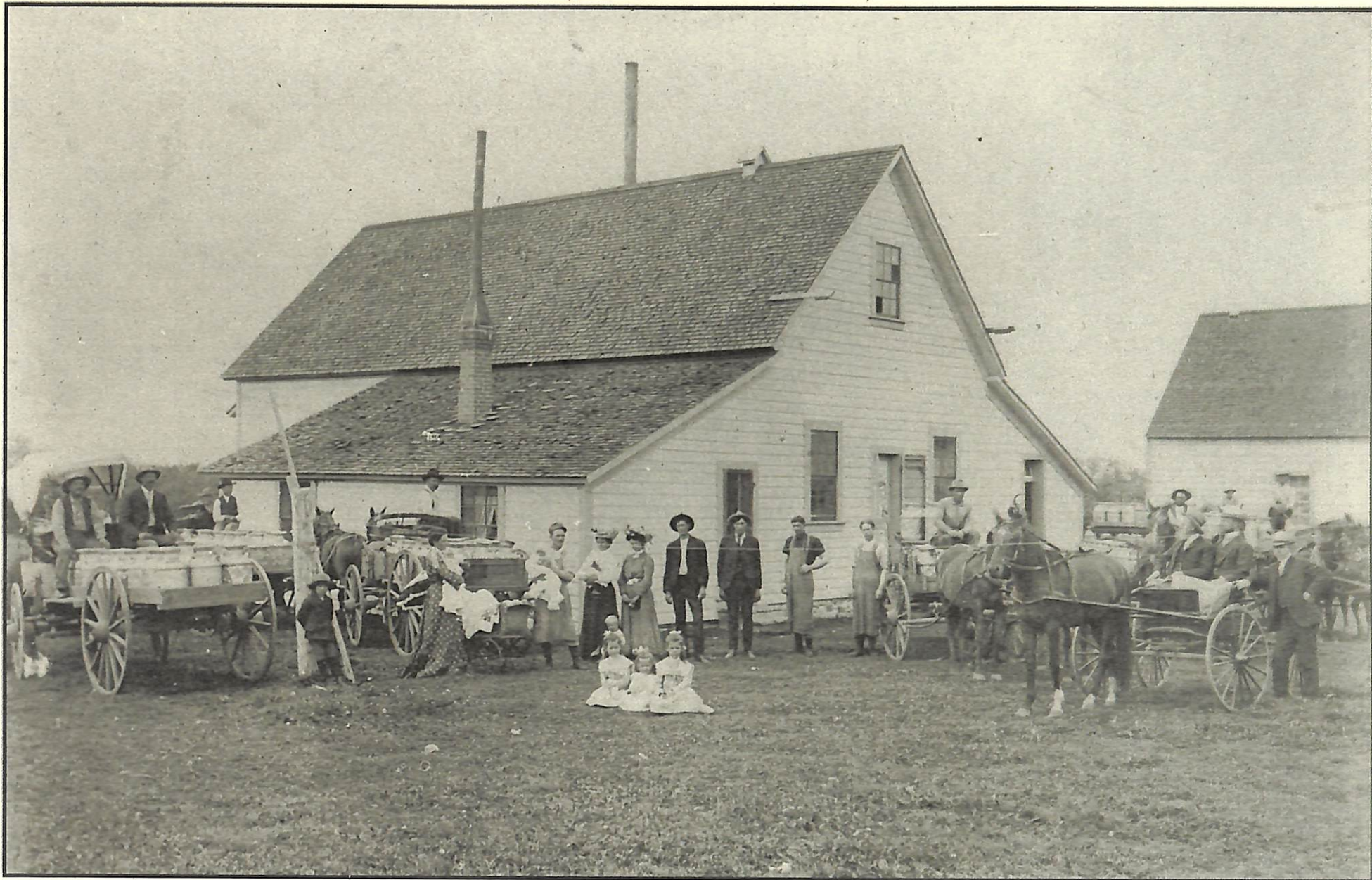
The Pioneer Creamery of Star Valley and of Western Wyoming Founded by Wm. W. Burton