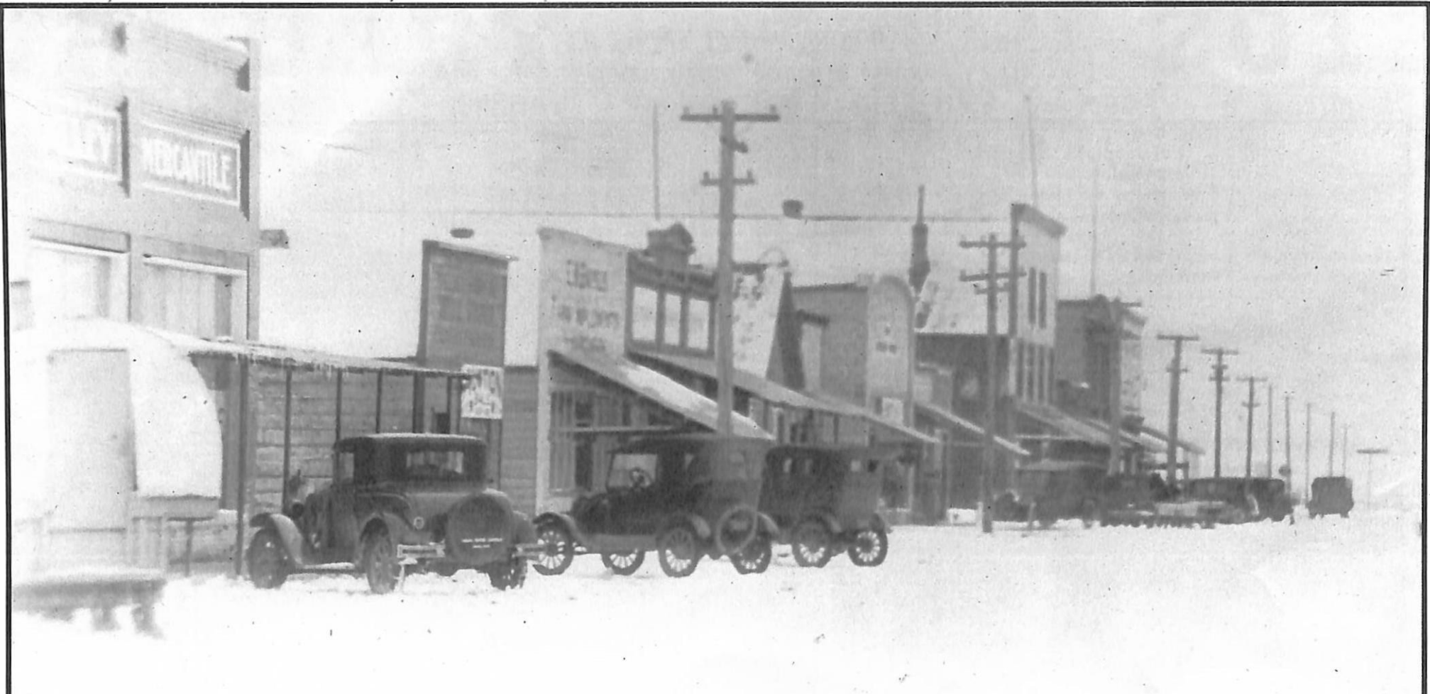
Main Street - Afton - 1900