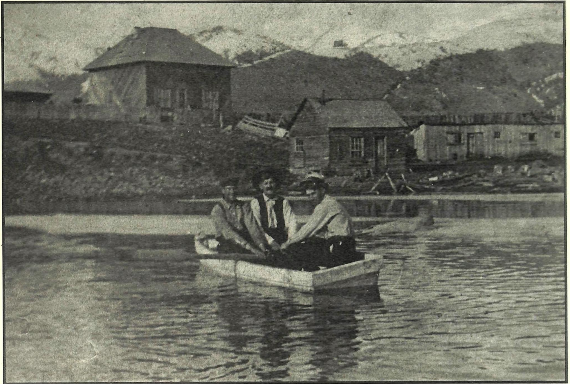
Three men in a boat on Schwab Saw Mill Pond in Smoot