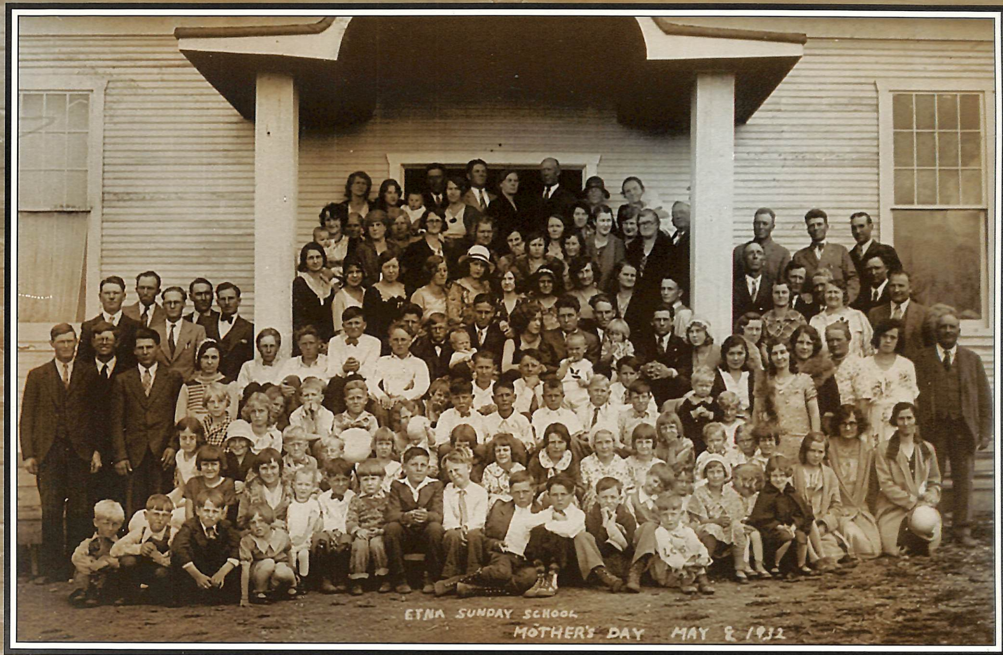
1932--Mother's Day--Etna Sunday School