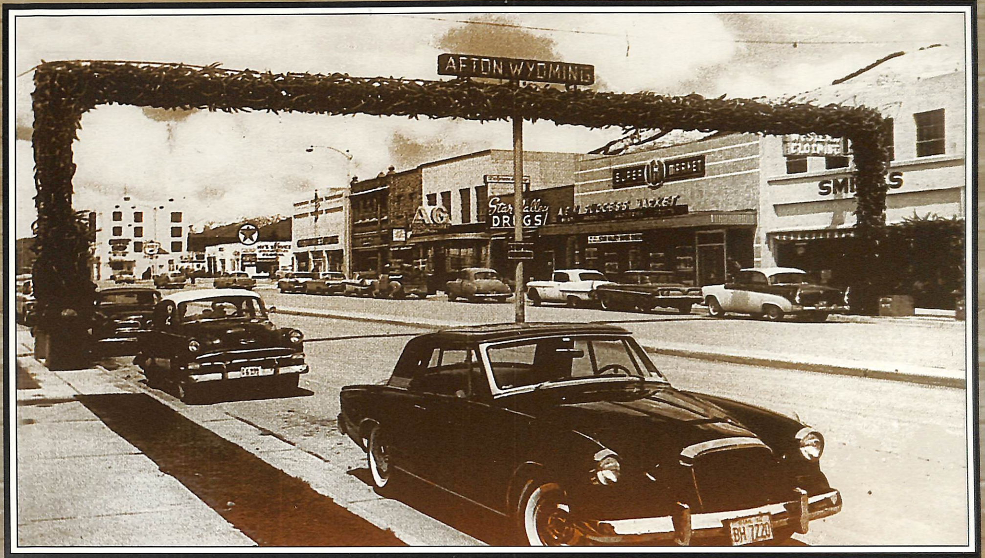
Afton Wyoming, Notice how the stores have changed, Late 50's The Elk Horn Arch was completed in July 1958