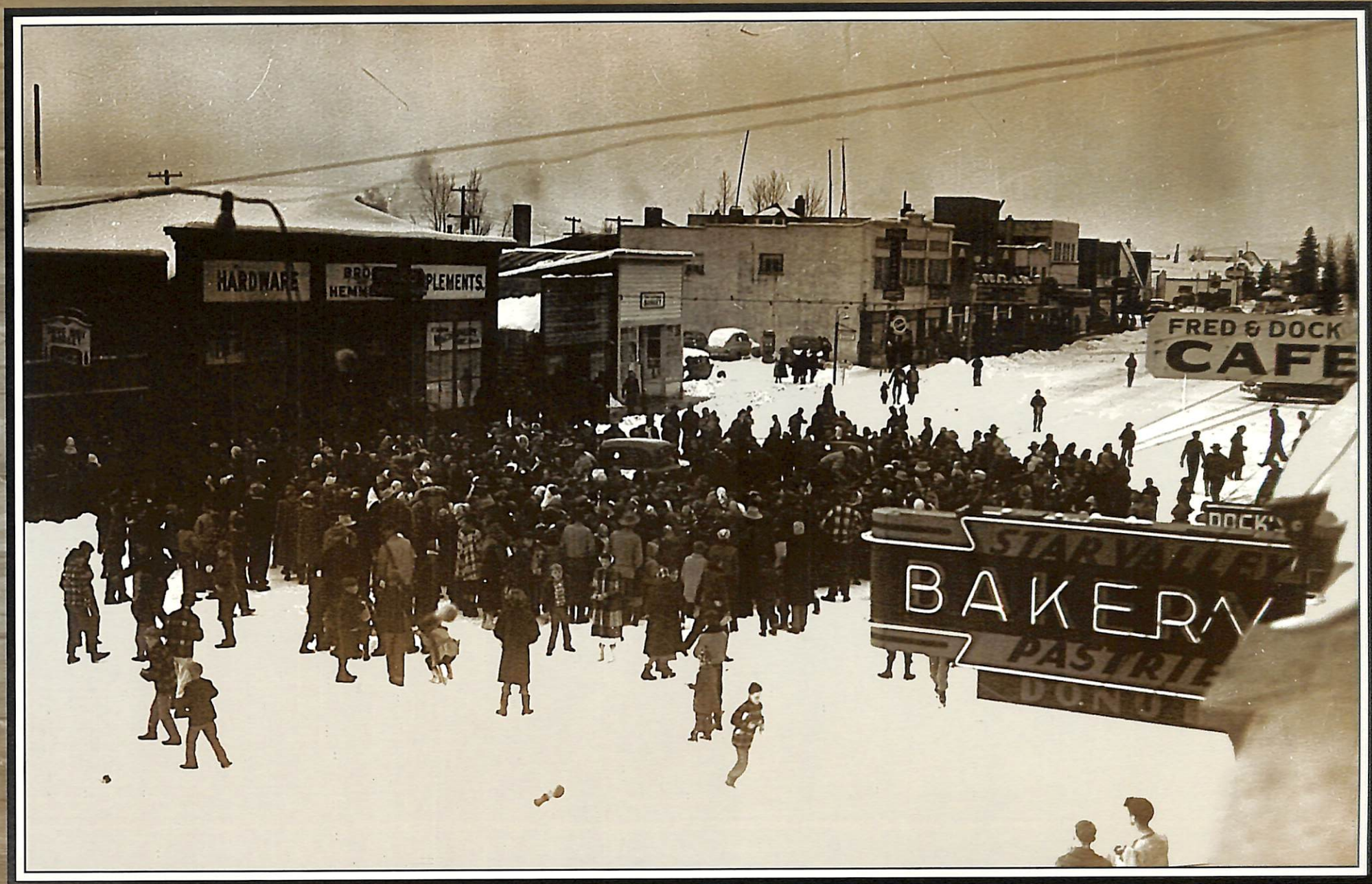
Santa Comes to Afton in 1938 The Star Valley Bakery opened in 1936