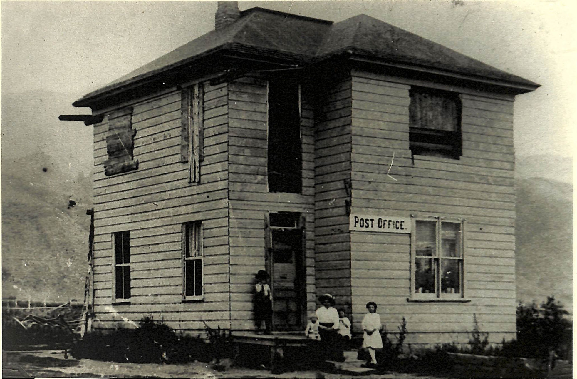
Grover Post Office Taken in the 1900's