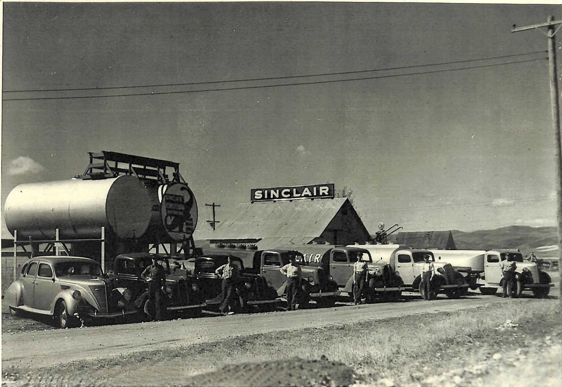
Sinclair Co. and employees.