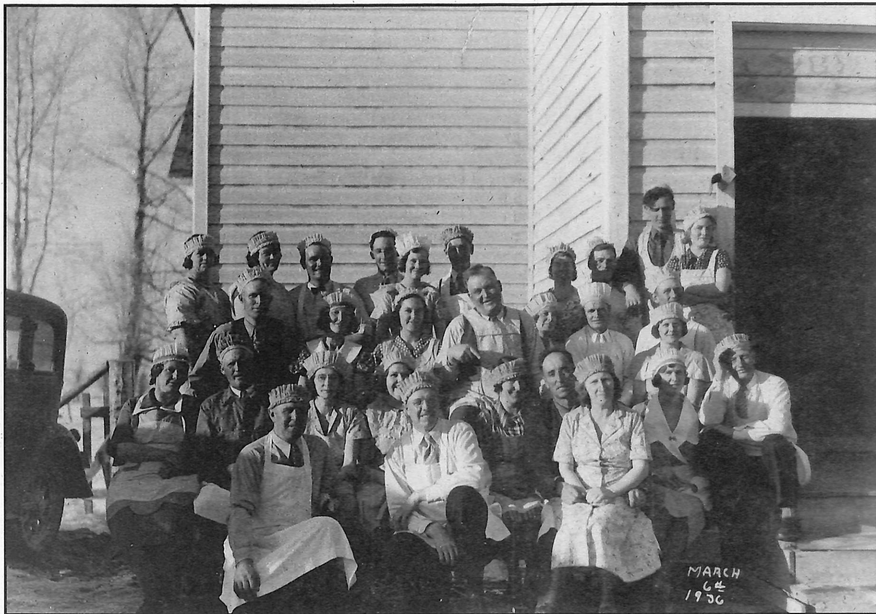
Picture in front of Fairview Church - March 6, 1936