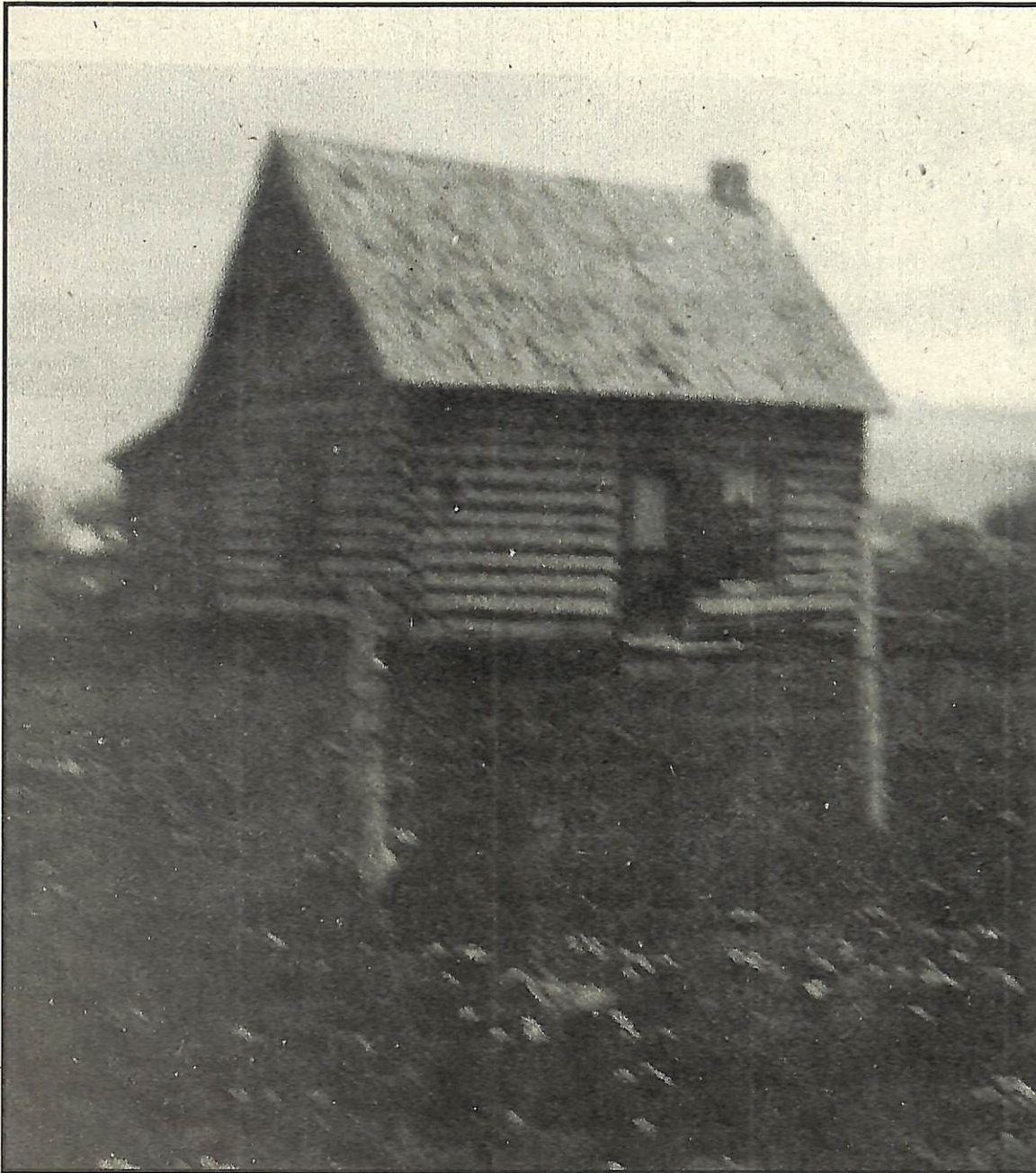
Grant Campbell built this home in Fairview, after arriving in 1884.