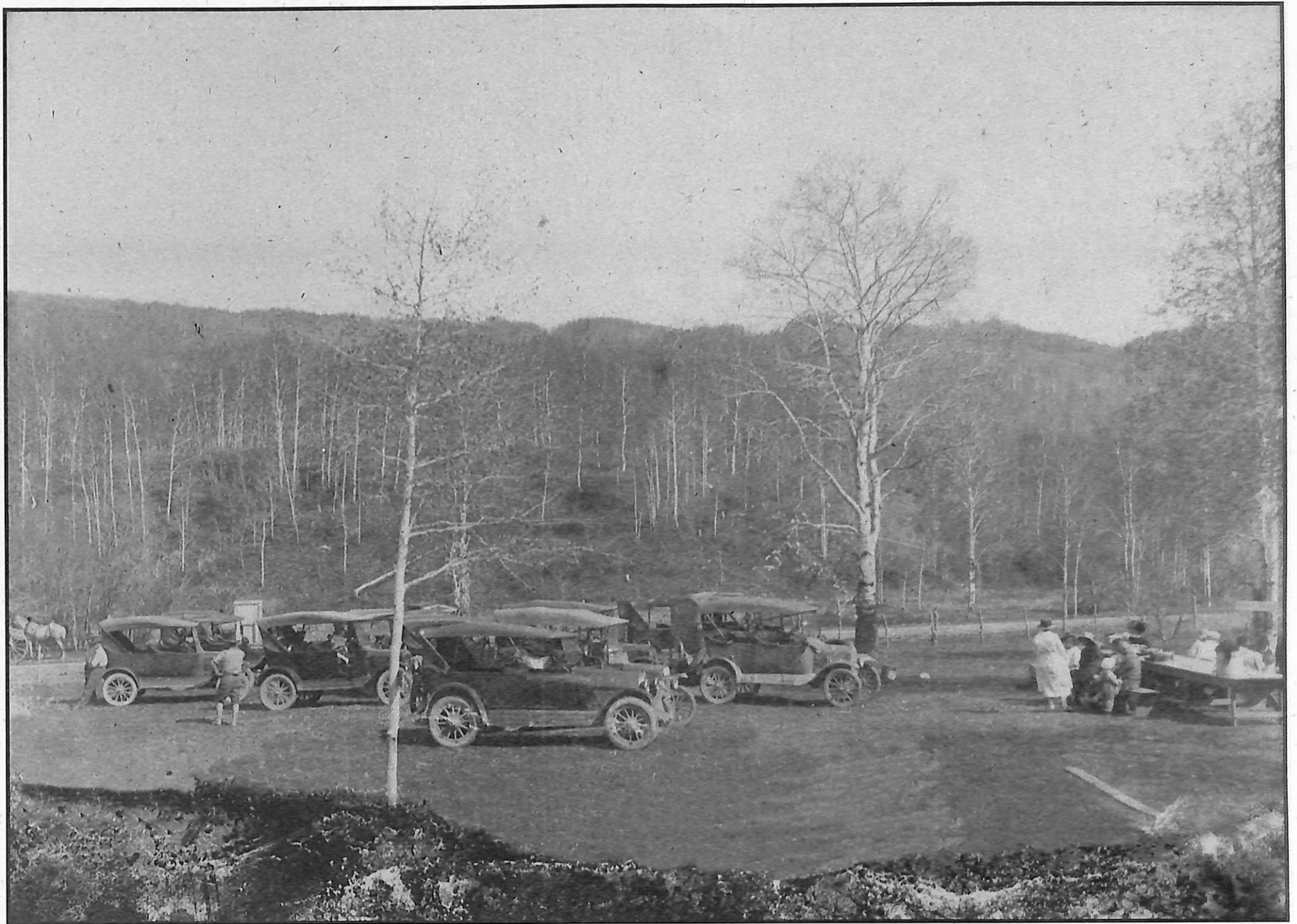
Picnic in the Narrows