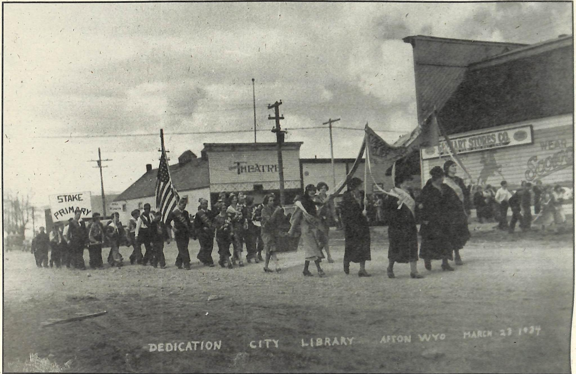
Dedication of the City Library - Afton, Wyoming - March 23, 1934