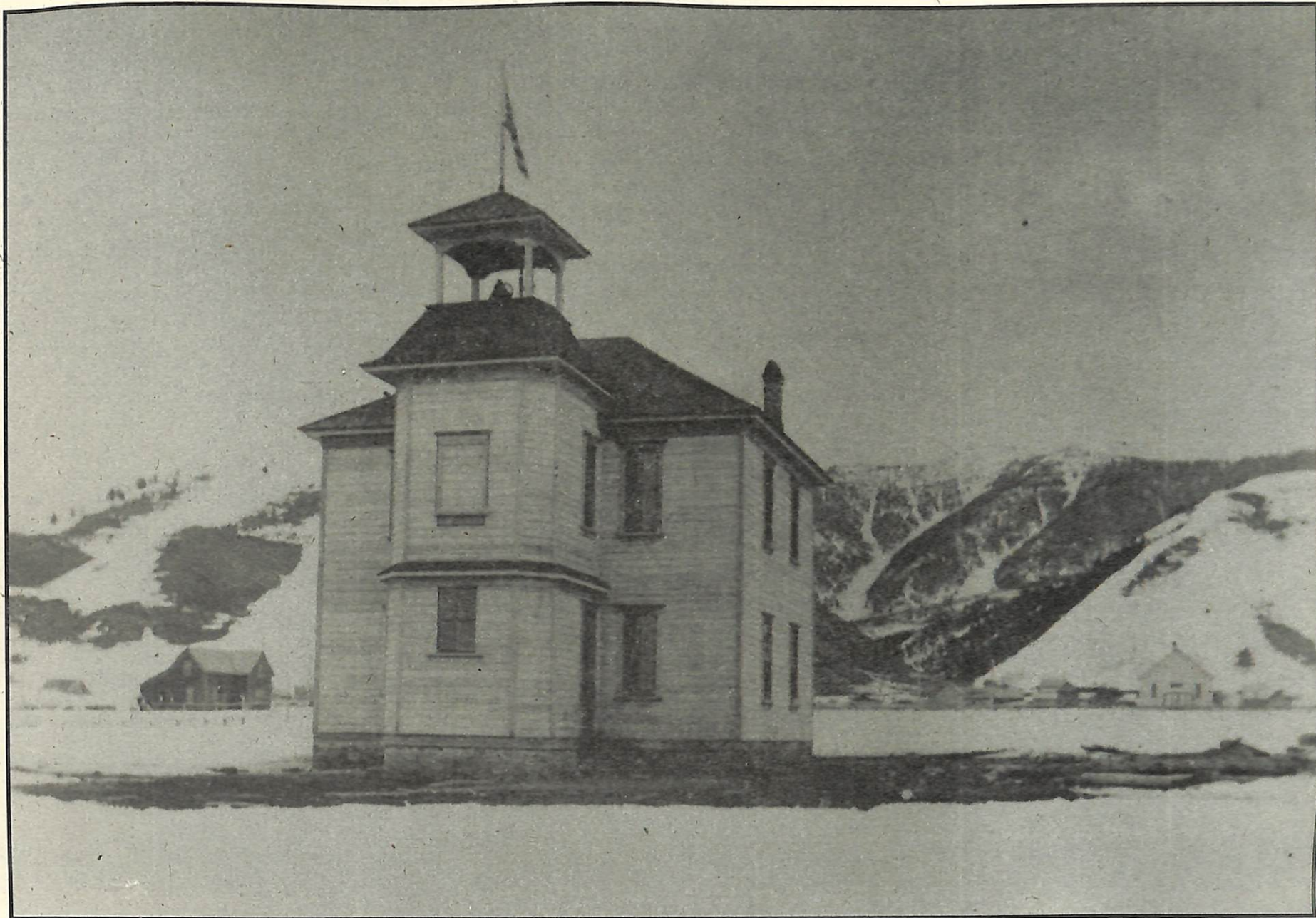
Grover School House built in 1900-1901. Gave 24 years of service.