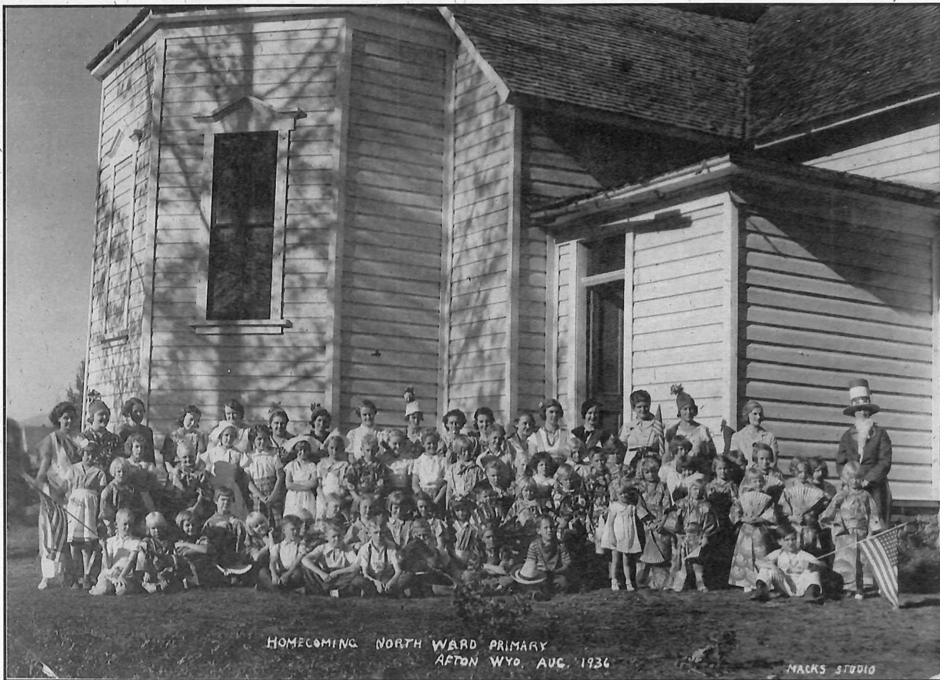
North Ward Primary - Afton, Wyoming - August 1936