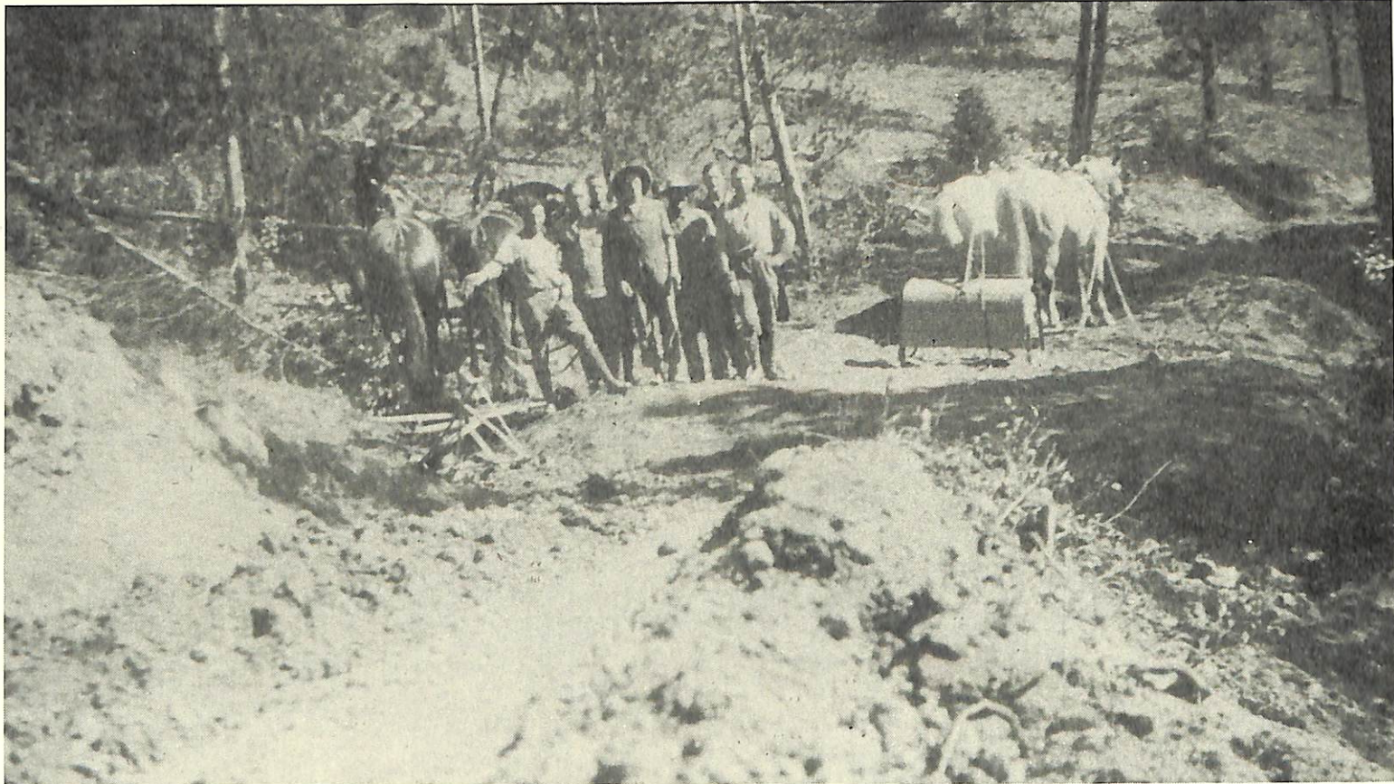
The Grey's River Road in its beginning.