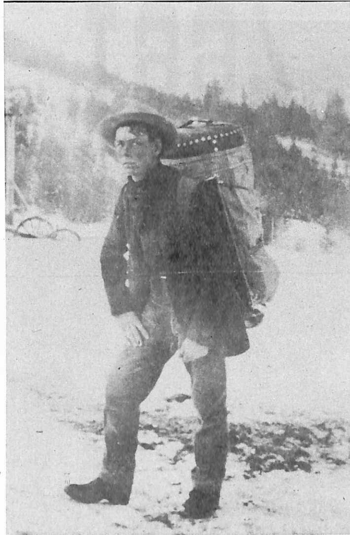
This is the way the mail was carried over the Crow Creek Road in the early days of Star Valley.